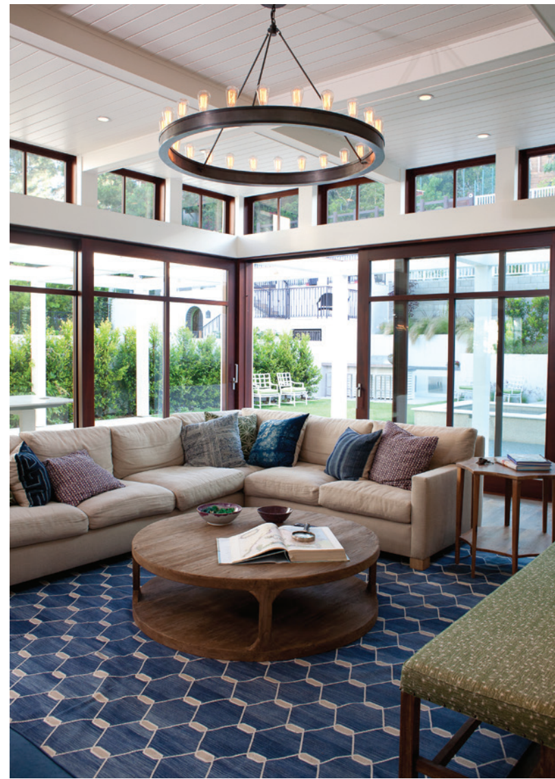
Clockwise from top: The family enjoys ample outdoor space; light pours in from multiple windows in the living room; soda bottles become chandeliers in the dining room.