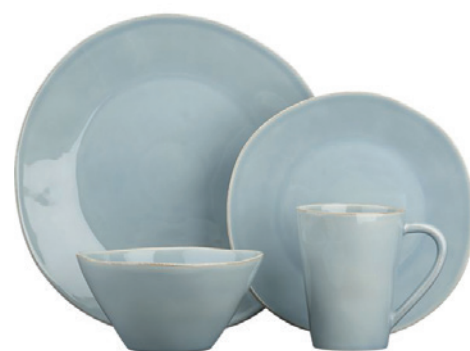
MARIN BLUE DINNERWARE SET $135.20 Crate&Barrel, crateandbarrel.com